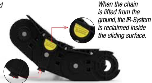
The lever commands the protrusion of the IR-System - Extended position